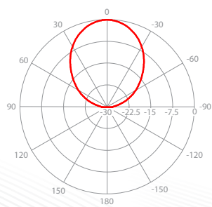
V/H - Port Pattern Azimuth 5.6 GHz